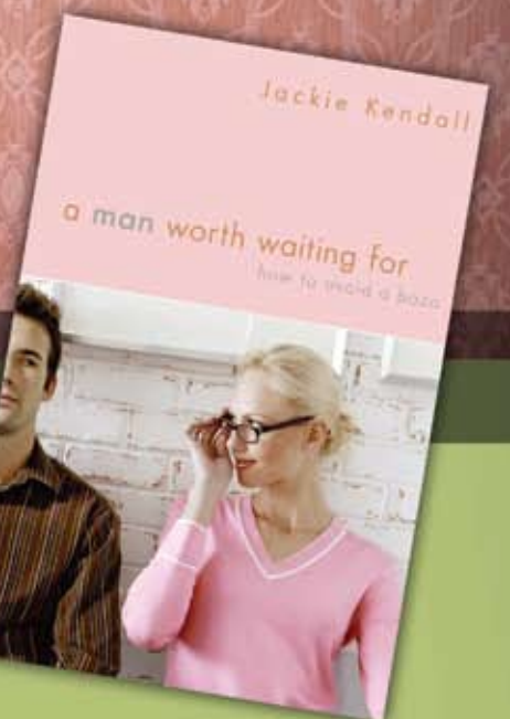
The eagerly awaited sequel to the bestselling LADY IN WAITING

"In a world obsessed with speed dating and quick-fixes, Jackie Kendall provides a refreshing road map for young women to confidently take the time to find 'Mr. Right' instead of 'Mr. Right Now.' Without a doubt, this is a book I will pass on to my daughter when she begins her journey." —Elisabeth Hasselbeck, cohost of ABC's The View